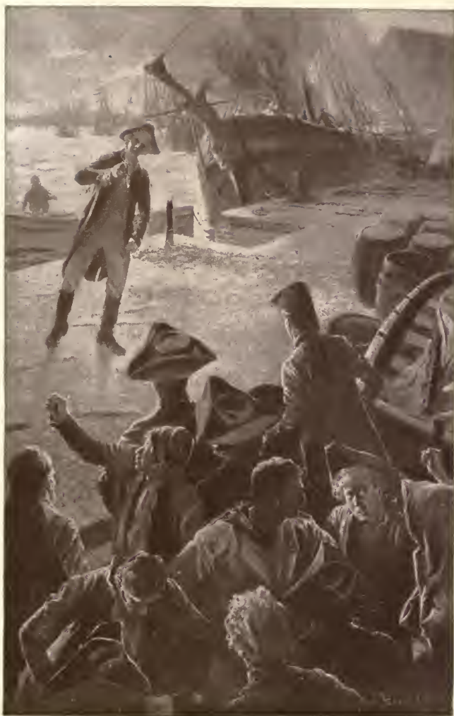
John Paul Jones Quelling the Mob at White Haven