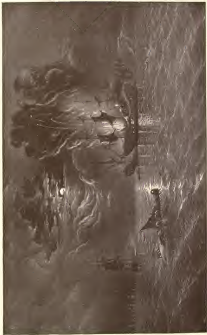
Engagement of Bouhomme Richard and Serapis