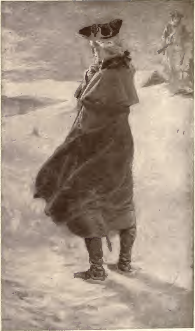
Washington at Valley Forge