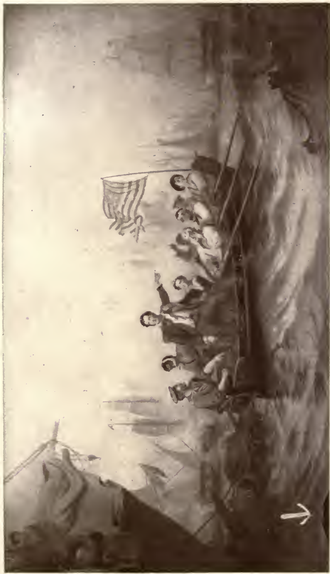
Perry en route from the Lawrence to the Niagara during the Battle of Lake Erie

(Painting by W. H. Powell in the Capitol at Washington. Arrow shows where vandal tried to destroy canvas, December 19, 1911)